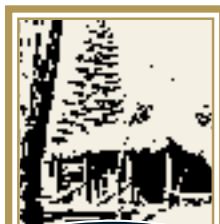
TRAIL CREEK CABIN 5