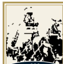
ORE WAGON MUSEUM 8