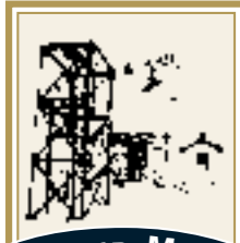
RUUD MTN CHAIRLIFT 3