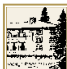
SUN VALLEY LODGE 10