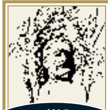
HEMINGWAY MEMORIAL 4