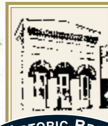
HISTORIC BRICK BUILDINGS 6