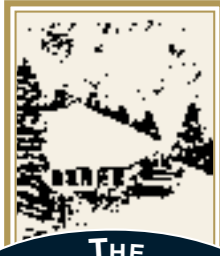
THE ROUNDHOUSE 1