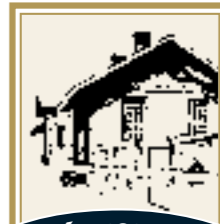
KETCHUM DEPOT (SITE OF) 7