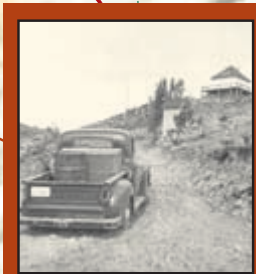
Heading up to Pinyon Peak Lookout in 1955.